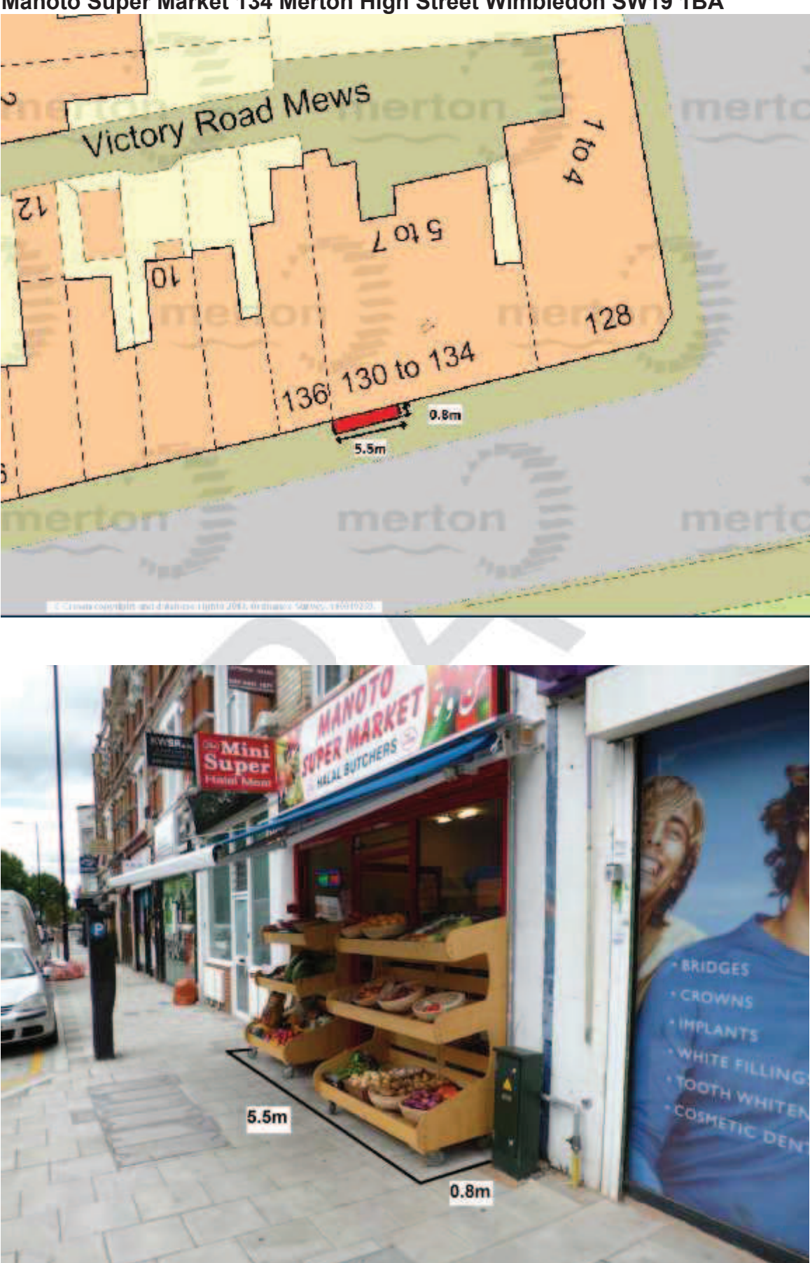
Manoto Super Market 134 Merton High Street Wimbledon SW19 1BA